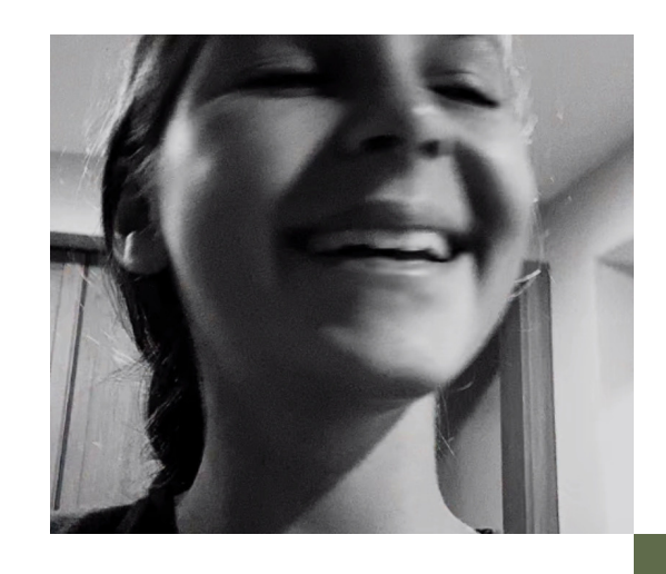
BUILDING A LEGACY OF GIVING BY INSPIRING THE NEXT GENERATION OF PHILANTHROPISTS.

Today's young people have concerns for the future but see themselves as part of the solution."